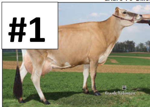
Dam: Gabys Maximum Spice-ET VG-85%

Sire: ALL LYNNS LEGAL VISIONARY-ET 117222740 Dam: GABYS MAXIMUM SPICE-ET 116027771 VG-85 0302 2X 305d 17,980M 5.2% 935 F 3.5% 630 P MGS: SUNSET CANYON MAXIMUM-ET 111950696 Third Sire: SC GOLD DUST PARAMOUNT IATOLA-ET 112118277